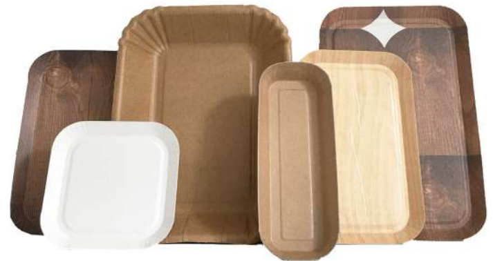
DELI PRODUCE CONTAINERS