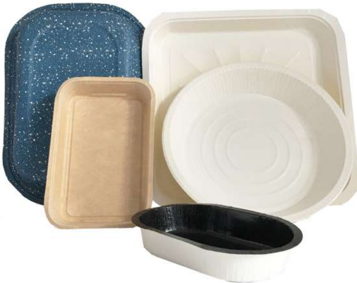
OVEN PROOF CONTAINERS